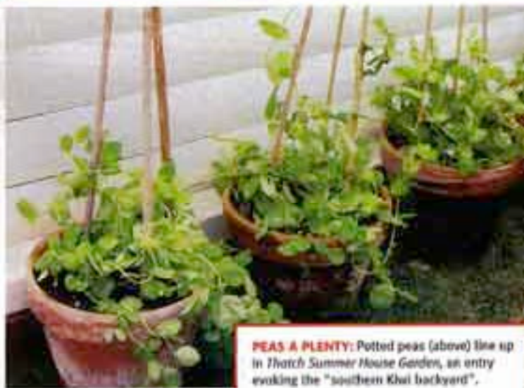
PEAS A PLENTY: Potted peas (above) line up in Thatch Summer House Garden, an entry evoking the "southern Khai backyard".