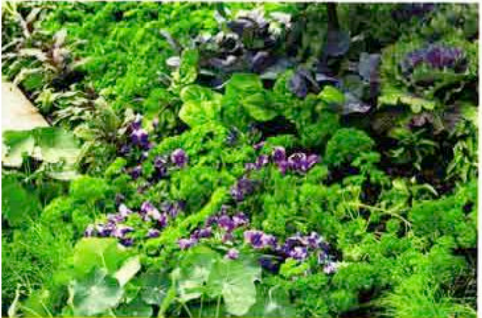
PRETTY AND PRACTICAL TOO! Kim Brown combined flowers and food-producing plants (above) in Sensory Garden - a relevant technique for growing your own vegetables in today's smaller gardens where space for flower and food plants is sometimes very limited if you want to have both.