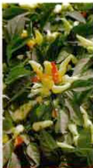
HOT FASHION: Colourful utilities (above) filled two roles in one garden exhibit – as ornamentals and food-producing plants.