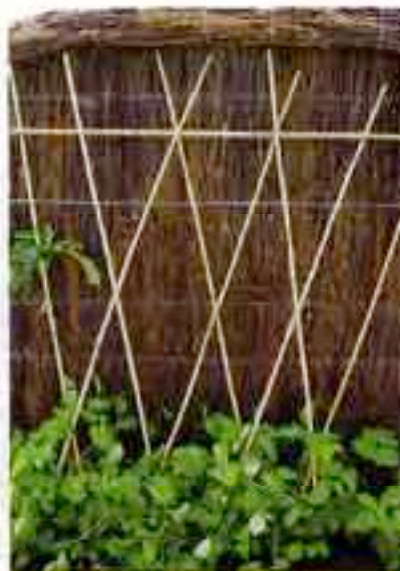
STAKE SOLUTION: Support for climbing beans (above) gets a decorative twist in Thatch Summer House Garden, an entry with traditional English elements.