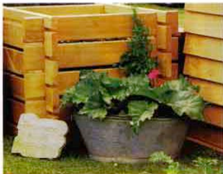
COMPOST CORNER: Rhubarb loves organic matter so what better spot for it than snuggling up to the compost bins (above) in Create Your Own Eden, designed by WormsRus, an entry that promoted recycling and food production.