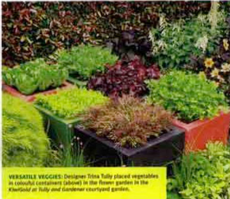
VERSATILE VEGGIES: Designer Trina Tully placed vegetables in colourful containers (above) in the flower garden in the KwiGold at Tully and Gardener courtyard garden.