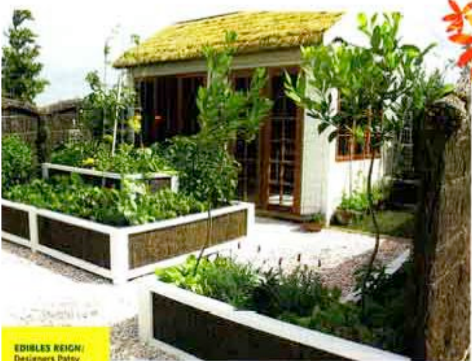
EDIBLES REIGN! Designers Patsy O'Malley and Chris Tabak stacked mostly food plants with a few flowers in a series of raised beds in Thatch Summer House Garden.